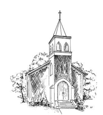
St. Stanislaus, Chatsworth Sunday 9:00 am

Welcome to your new parish! You will find registration forms at the back of the Church. Fill one out and drop it in the collection basket.